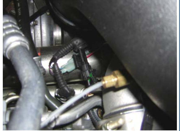
LLY Fuel Rail Pressure Sensor